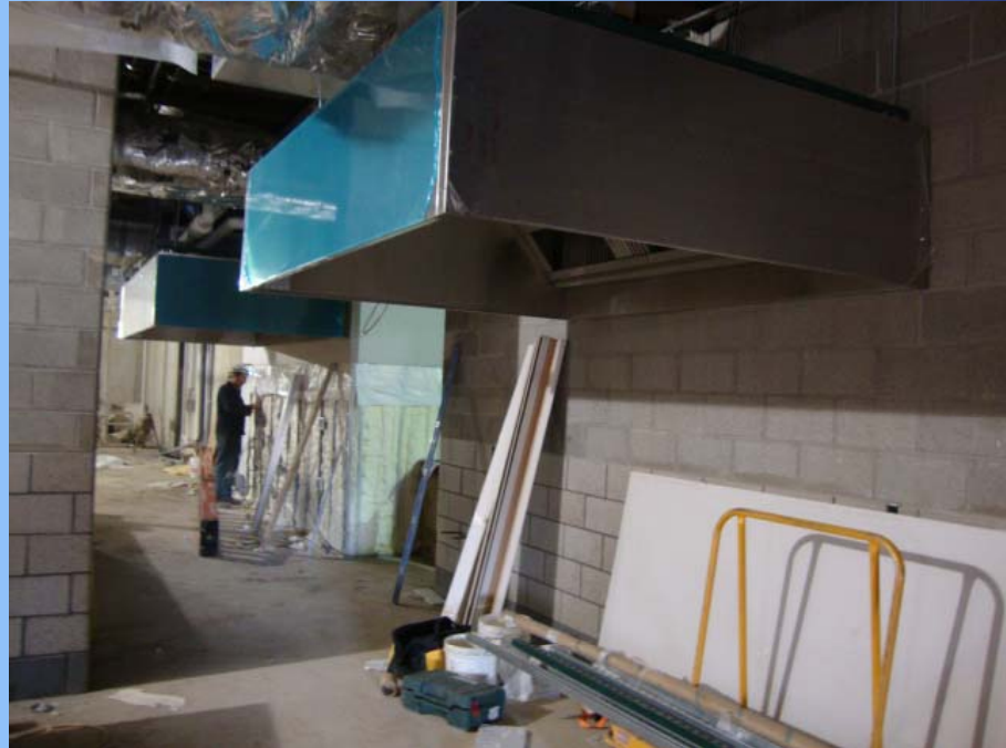
*Kitchen hoods (above)